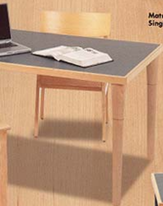
Matrix Two-Position Single-Faced Adder

Matrix Series furniture shown with: Clear Wood Finish Saphir Textured Hammertone Metal Finish Slipstream Capri Laminate Maharam Pipa Whim Upholstery