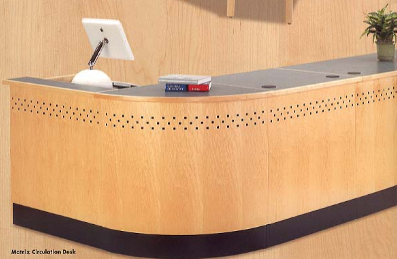
Matrix Circulation Desk