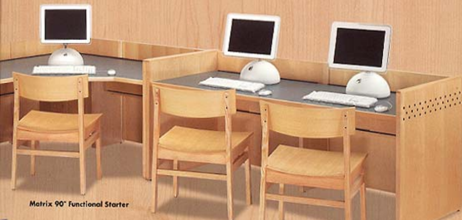
Matrix 90° Functional Starter