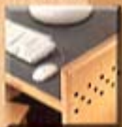
Matrix Two-Position Single-Faced Starter

Matrix Series furniture features 5/8" external bullnose solid wood edge banding.