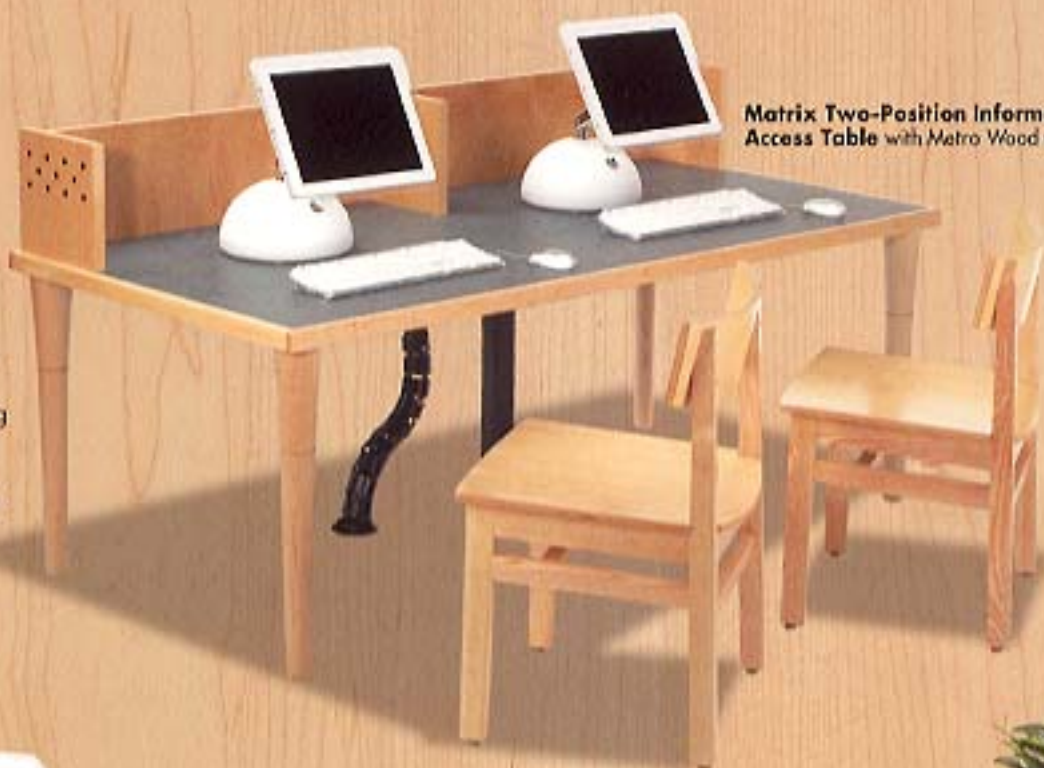
Matrix Two-Position Information Access Table with Metro Wood Chairs

With Brodart's optional cable duct system, flexible housing elements add additional style to your Matrix furniture while keeping technology cables organized and out of sight. Housing elements can run vertically to any desk height and be easily arranged into the configuration of your choice.